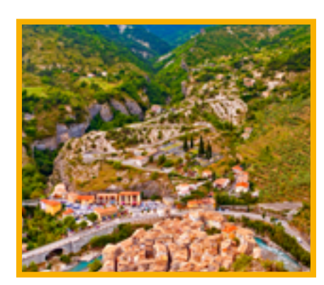
Pignes train excursion