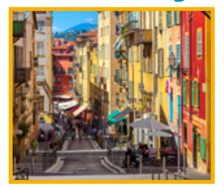
Visit of the old town