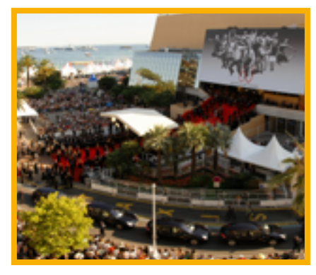
Day in Cannes