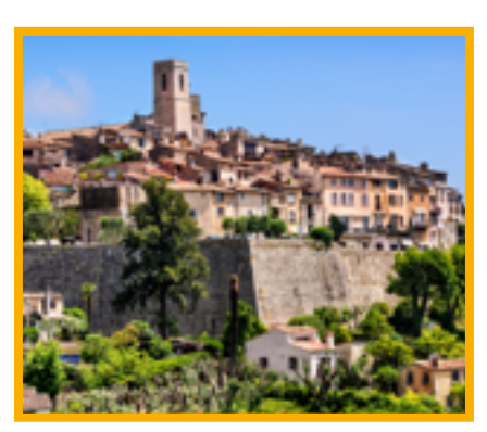
Day in Saint Paul de Vence