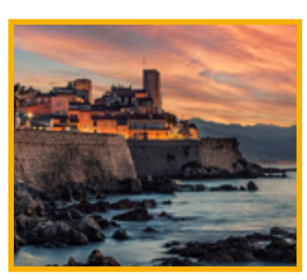
Day in Antibes