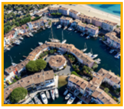
Day in Saint Tropez