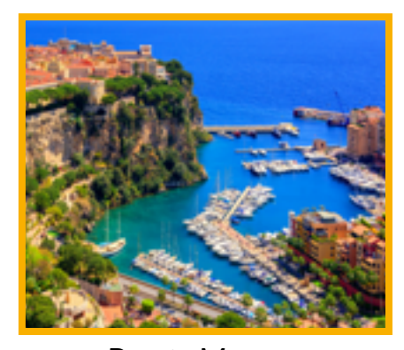
Day in Monaco