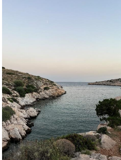
My favourite beach. One hour from Athens