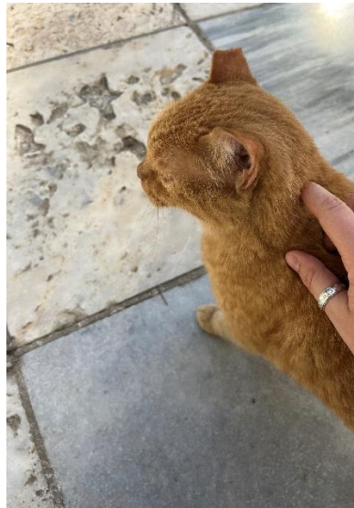
Hope you love cats. Athens has a lot of them