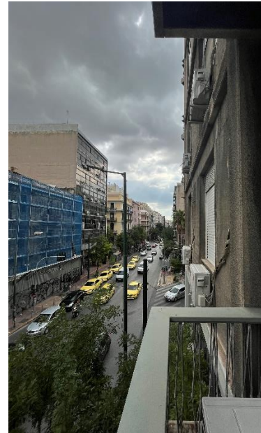
View from my balcony