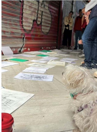
Free Hand Drawing with Professors dog