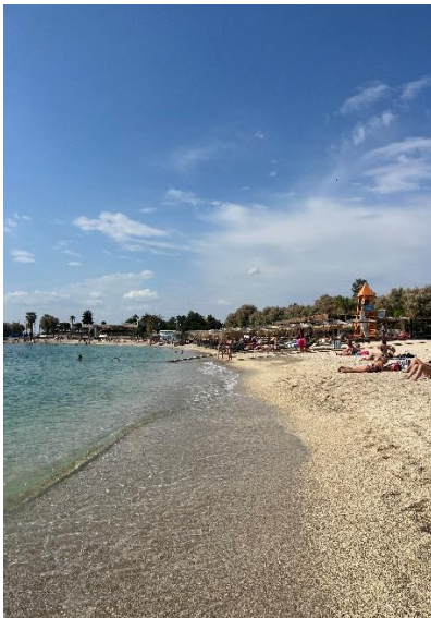
The closest beach from Athens