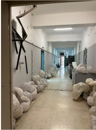
NTUA from inside